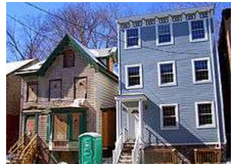
These homes on Chambers Street in the City of Newburgh show the 2 faces of contemporary Newburgh: both historic; one newly renovated the other exemplifying urban blight

In other communities, like the City of Newburgh, urban blight remains an issue with a high number of vacant properties. The city is witnessing positive momentum toward the revitalization of many decrepit structures and wants to ensure equitable development without displacement.