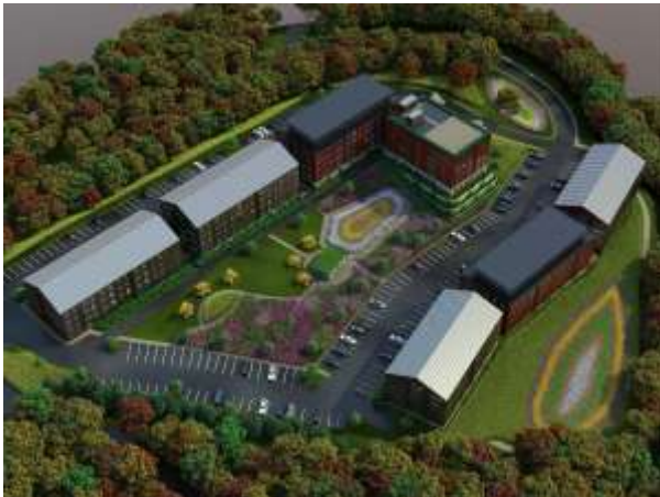
A rendering of the 22 Edgewater Place project presented to the Beacon Planning Board

Hudson Valley Pattern for Progress has invited a number of nationally recognized leaders in the field of community development to help us answer these questions. These leaders will discuss tools, examples, and methods of successful urban revitalization strategies that can be utilized in small cities. In this solution-based forum, speakers will provide examples of best practices from other communities, and discuss successful community revitalization and affordable housing efforts from other communities.