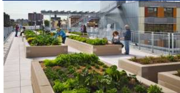
Via Verde’s garden club cares for the vegetable gardens on the fifth-floor roof.

well as a ground floor health, education and wellness center, pharmacy, gym, community room, kitchen and outdoor play area. Its green features include: energy efficient HVAC; green roofs that include fruit trees and a vegetable garden; solar power; and a location near schools, sports fields, public transportation and shopping. iv Via Verde is an example of putting into practice the concept of integrating housing, health, education, transportation, open space and healthy food policies to regenerate communities and increase opportunity for residents.